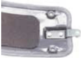
HD#52467-00 (sold through dealers)

2000-05 models require the stock rear mounting bracket (HD# 52467-00) be removed from the stock seat and bolted to the Mustang seat.